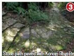
Stone path paved with Konogi Rhyolite