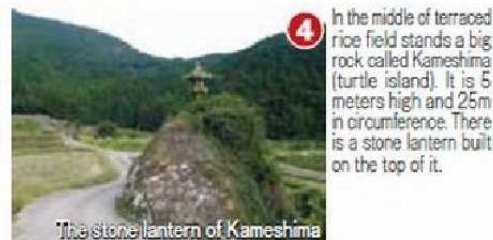
The stone lantern of Kameshima